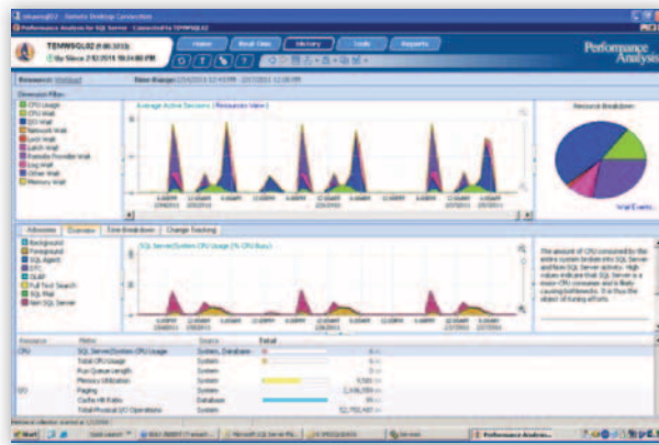
SQL Server: Performance analysis